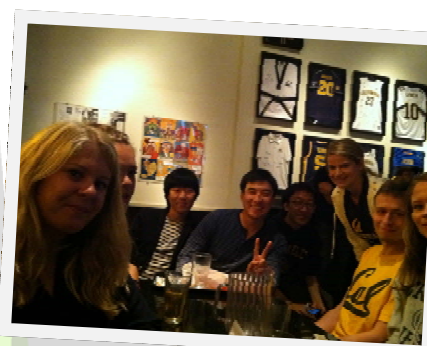
Experience New Cultures