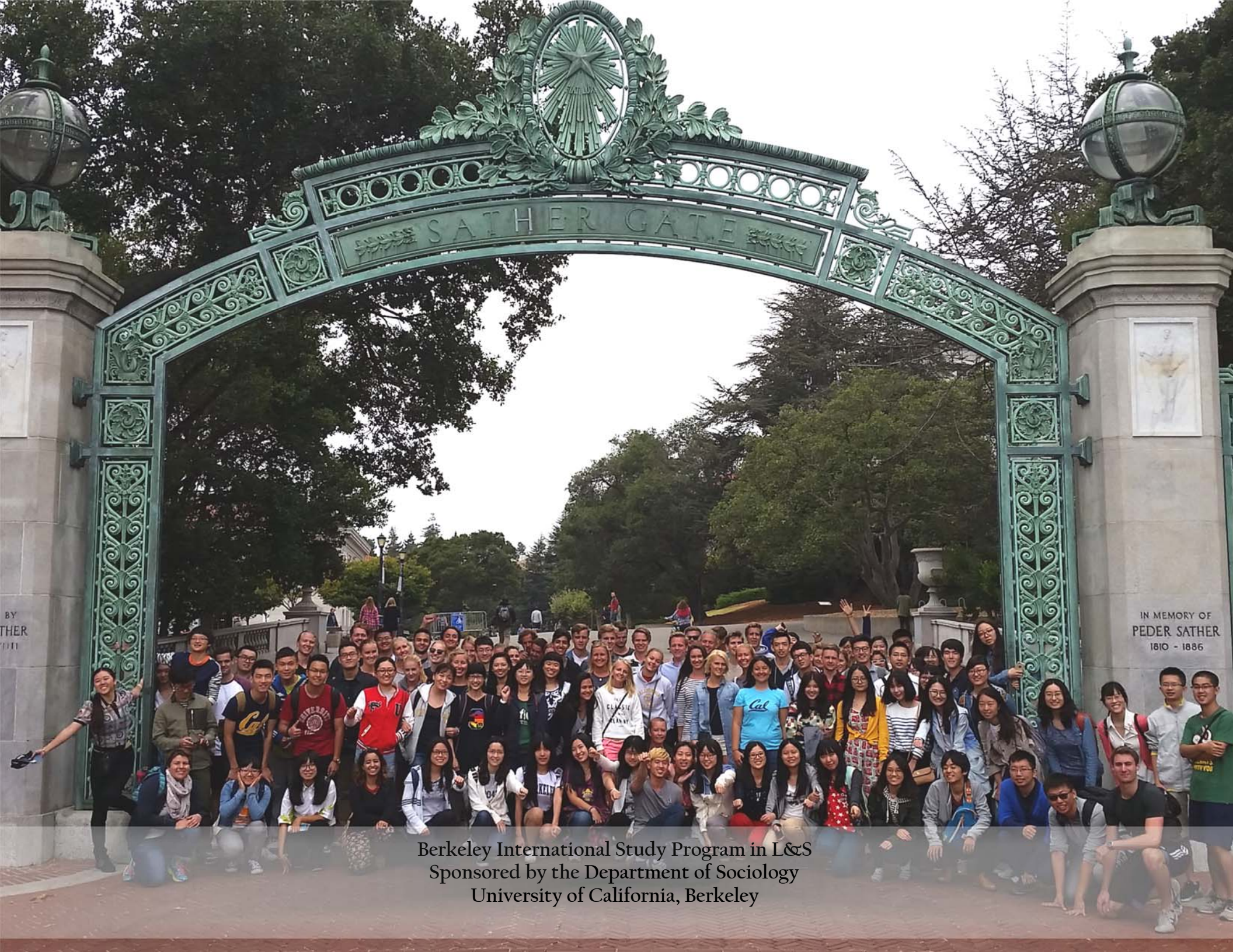
Berkeley International Study Program in L&S Sponsored by the Department of Sociology University of California, Berkeley