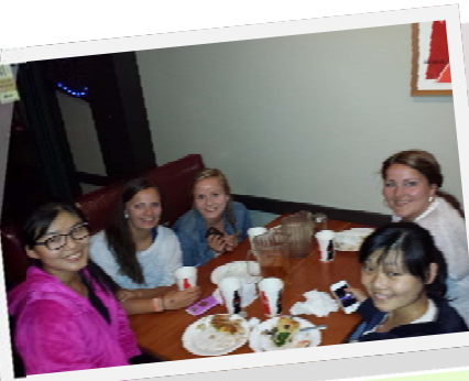
Make New Friends