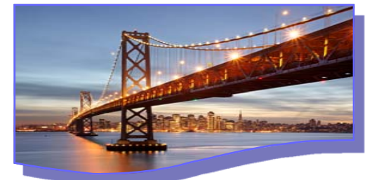
City of San Francisco: San Francisco-Oakland Bay Bridge