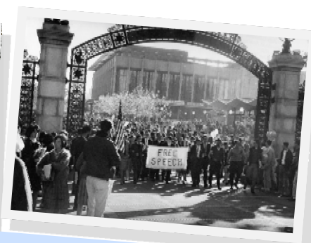
Learn about Berkeley